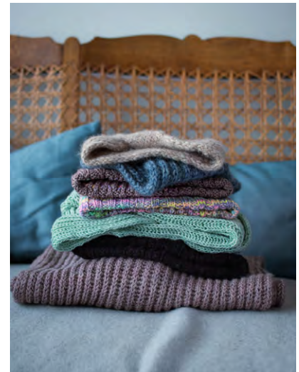
KNIT A BRIOCHE ACCESSORY COURSE