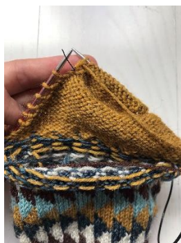
**Diagram B: Where to pick up the stitch for M1 for the short row heel after a P2tog.