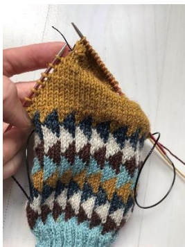
*Diagram A: Where to pick up the stitch for M1 for the short row heel after a K2tog.