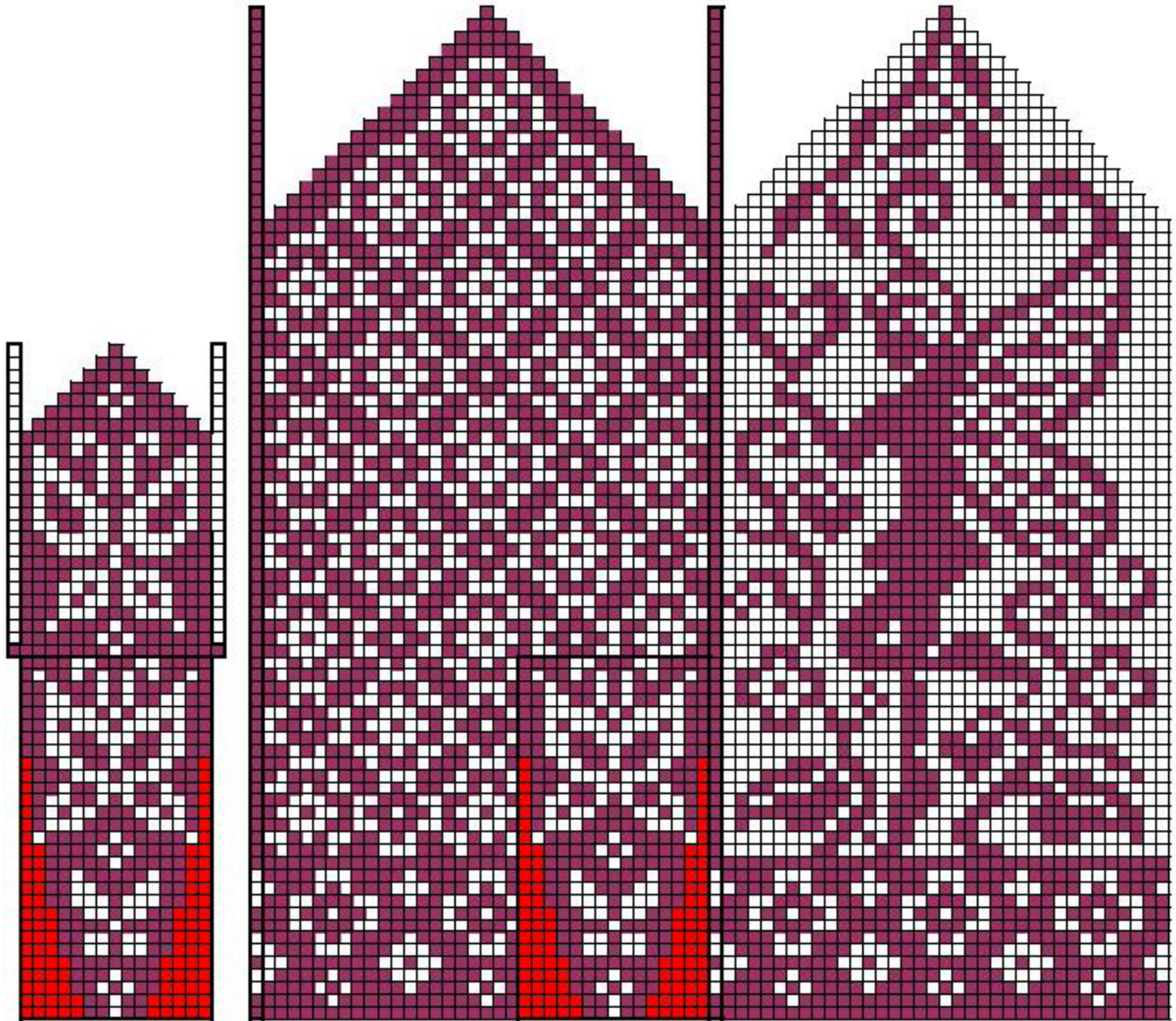
Chart Adult right