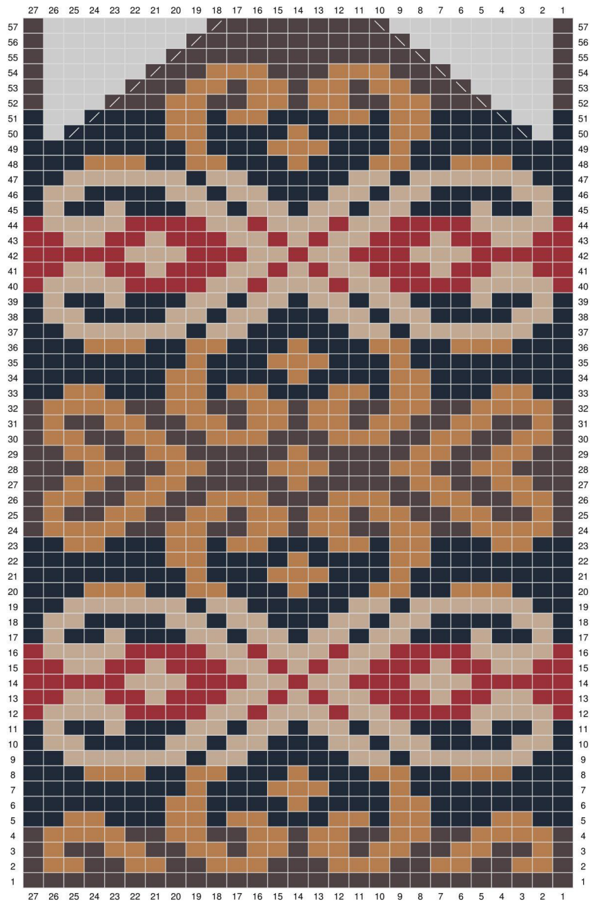
Chart A - Charmed Mittens