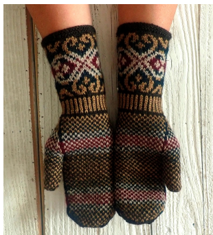
The palms of Charmed Mittens

Work left thumb same as right. Weave in all ends and block.