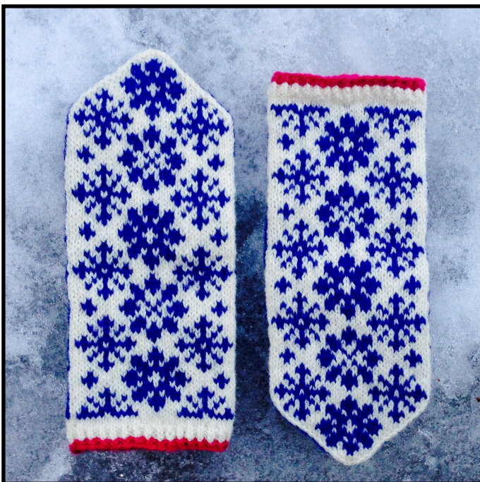
Berchta mittens with snowflakes