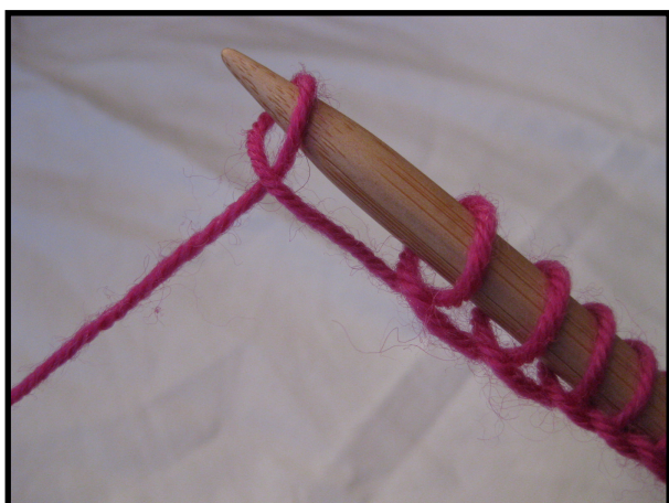
Fig. 1 - Backwards loop cast-on