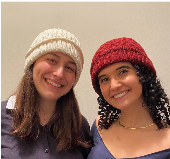
Ecru: wave side