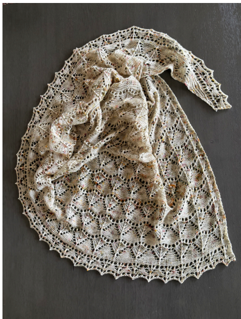
Large, shown in Toad You So

This asymmetrical scarf will take out the chill of the day!