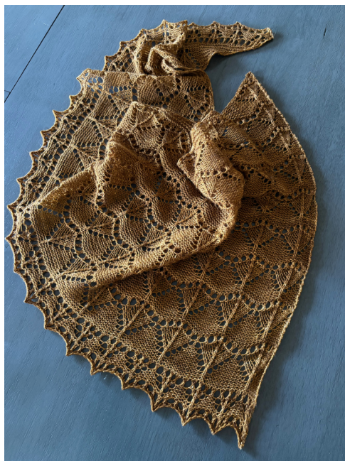
Small, shown in Bronze