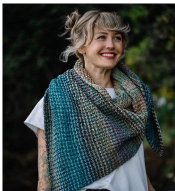
Inclinations Shawl drea renee knits