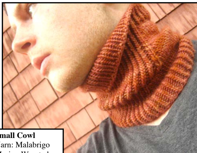
Small Cowl Yarn: Malabrigo Merino Worsted Colorway: Cognac