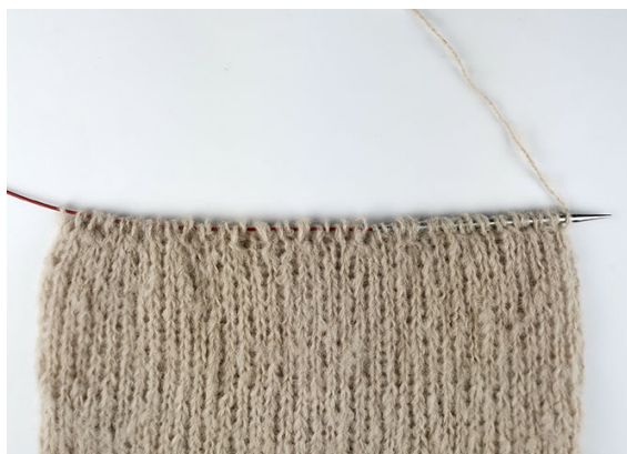
Pic. 2: 60 stitches gathered on one needle.

Pick up the working yarn again and work the first fringe over the first 6 sts , using a 6.0 mm ndl, slip rem 54 sts onto a stitch holder ( Pic. 3 ). Work first fringe in Double Knitting technique, as follows: