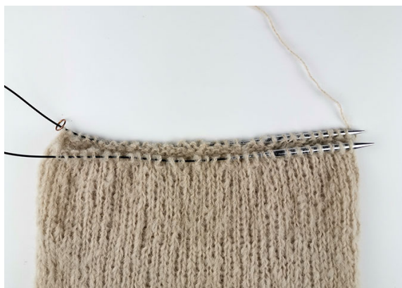
Pic. 1: Place needle tips of circ. ndl parallel to each other.

For the fringes, place the sts together on a circular ndl size 6.0 mm, so that you can knit in rows. To do this, place the needle tips of the circular ndl size 7.0 mm parallel to each other, so that there are 30 sts on each side ( Pic. 1 ). Then, using circular ndl size 6.0 mm, alternately sl 1 st on the front ndl tip and 1 st on the back ndl tip without twisting the sts, until all 60 sts are on circular ndl size 6.0 mm ( Pic. 2 ).