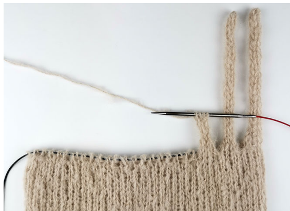
Pic. 4: Work the total of 10 fringes one by one, using the double knitting technique.

Tip: „Before knitting the fringes on the opposite side of the scarf and closing the “tube”, weave in all yarn ends inside the scarf.”